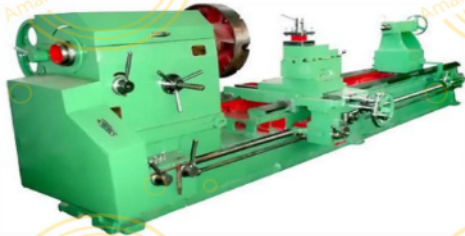
LATHE MACHINE ROLL TURNING PLANNER CENTRE 16" / 18" / 20" / 22" / 24" / 26" / 30" / 34" 406MM / 457MM / 508MM / 559MM / 610MM / 660MM / 762MM / 864MM