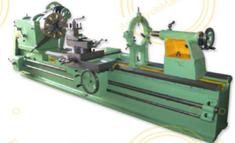
LATHE MACHINE HEAVY PLANNER TYPE CENTRE 28" / 30" / 32" / 34" / 38" / 46" 711MM / 762MM / 813MM / 864MM / 965MM / 1016MM